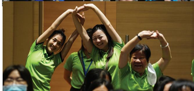
Our educators participated in Zumba and learned relaxation exercises, one way of alleviating stress.