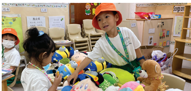
Learning through Action: Children from Kinderland Preschool @ Sunshine Place learn entrepreneurship skills while managing the booth