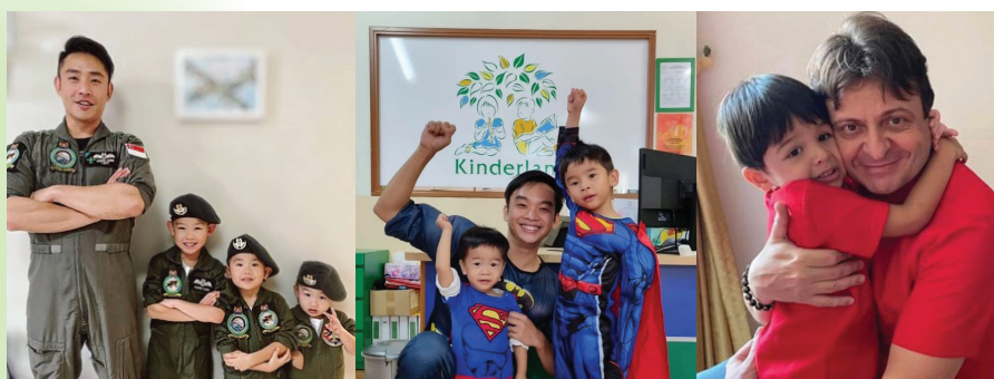
Our father got into action with their mini juniors for a twinning post!

Father's Day brought another occasion to celebrate family ties and creative expression. We organised a contest titled "Dad's Twinning Challenge". Its goal was to inspire children to understand and appreciate their father's daily roles in a fun, interactive manner. For this challenge, children were asked to strike poses that best mimicked their dad's style or daily routine.