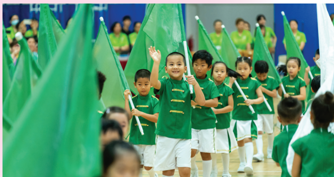
Making its debut, the Colour Guard performance from Kinderland Preschool @ Marine Parade showcased our children's coordinated movements and marched to music, emphasizing their rhythm and musicality

Since its inception in 2017, Kinderland's preschool stage ensemble has created more opportunities for our children to showcase their musical talents. Our preschool stage ensemble has participated in events held by Early Childhood Development Agency, People's Association and Esplanade.