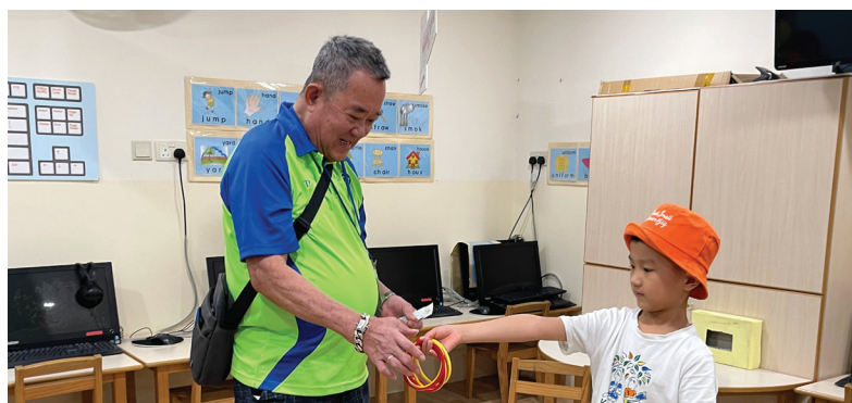
Children applying the skills and values gained from the A to Z Programme in real life