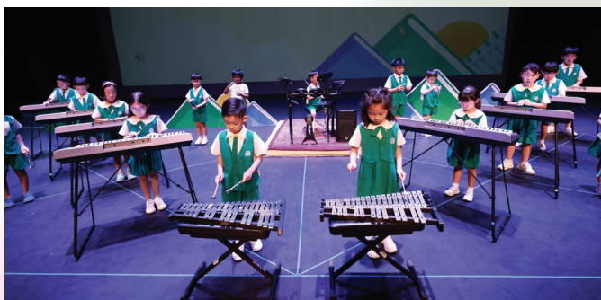
Our stage ensemble performance at Kinderland Graduation Concert 2022