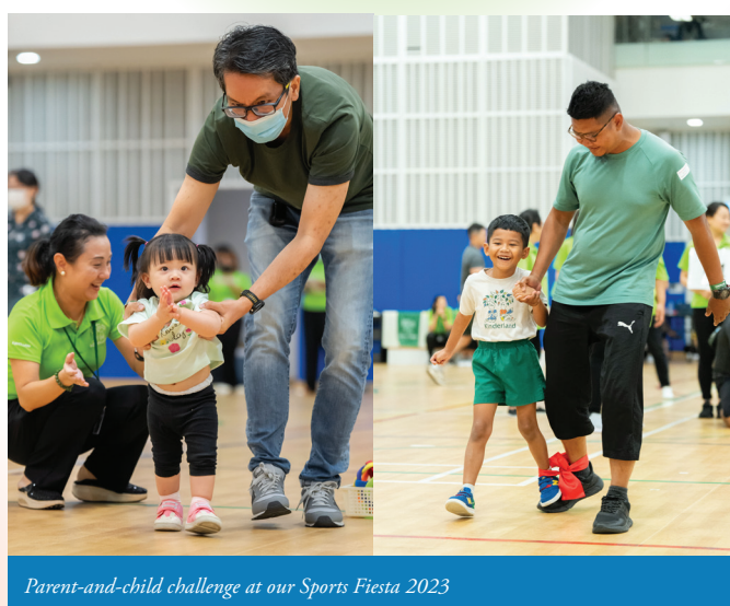
Parent-and-child challenge at our Sports Fiesta 2023