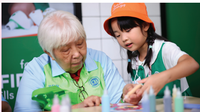
Our child from Kinderland Preschool @ Ministry of Manpower guided the elderly during the arts and crafts sessions