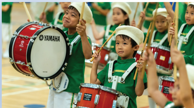
Our Marching Band performing in Sports Fiesta 2023

This year, 50 children from Kindergarten One and Kindergarten Two came together to perform two musical pieces at the annual Kinderland Sports Fiesta.