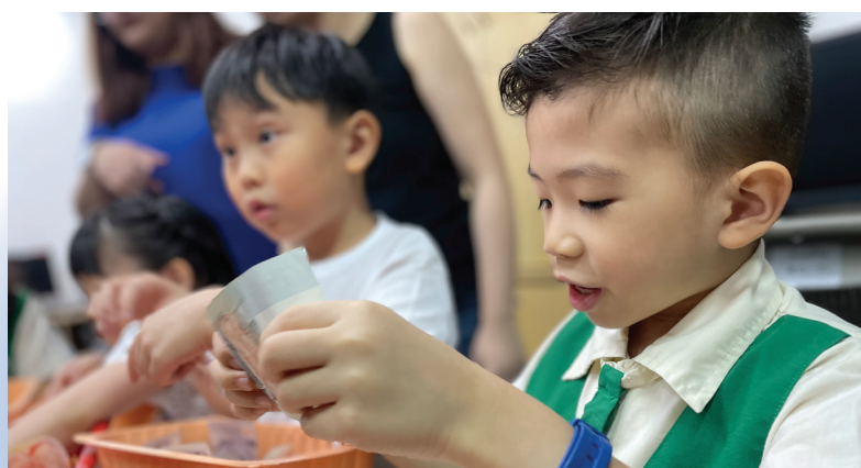
Our children put their maths learning to practise when sorting bank notes during the fund counting process

Introduced this year, the Character Building A to Z Programme is designed for children aged three to six. It aims to develop well-adjusted individuals by instilling strong moral and educational values. The curriculum covers manners, personal and social responsibility, a growth mindset, and mindful problem-solving skills.