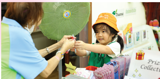
Our child from Kinderland Preschool @ Hougang presented a token of appreciation to the elderly

One memorable feature was the involvement of elderly members from LB in some of our centre's events. This intergenerational bonding went beyond mere social inclusivity. It created opportunities for our children to interact with the elderlies, allowing them to learn empathy and kindness in a profound and personal way.