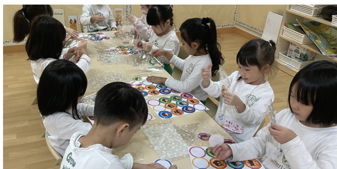
Children from Kinderland Preschool @ Woodlands Mart preparing for SSDB

Our activities were designed to provide opportunities for children to develop valuable life skills, not just raise funds. These events gave our young learners the opportunity to showcase abilities in problem-solving, mathematical understanding, and creative thinking. By translating classroom lessons into real-world activities, we made learning both engaging and relatable.