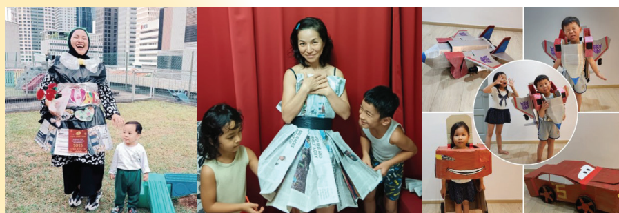
Our family got together to create beautiful recycled outfits for our mothers!